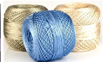
Jednotky DEN a tex?