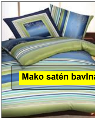
Mako satén bavlna